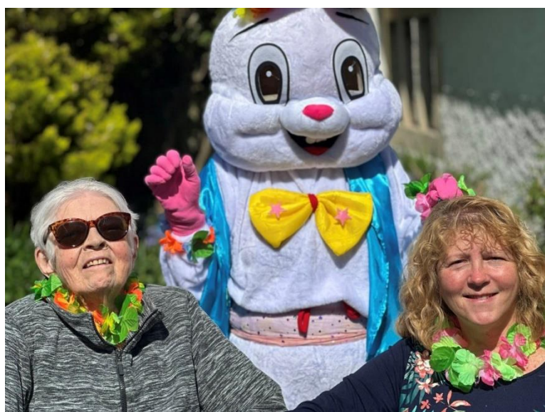
an Egg-cellent Easter party!