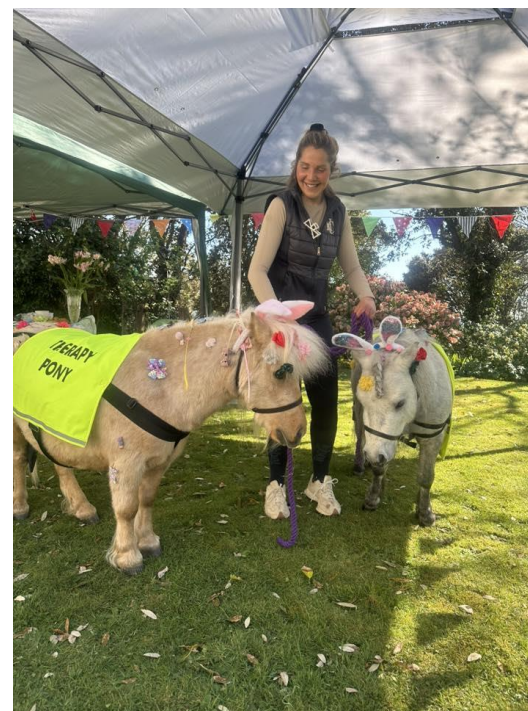
from two Shetland ponies!