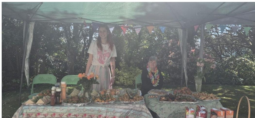
and friends joined us on this special occasion